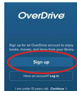
Sign up screen